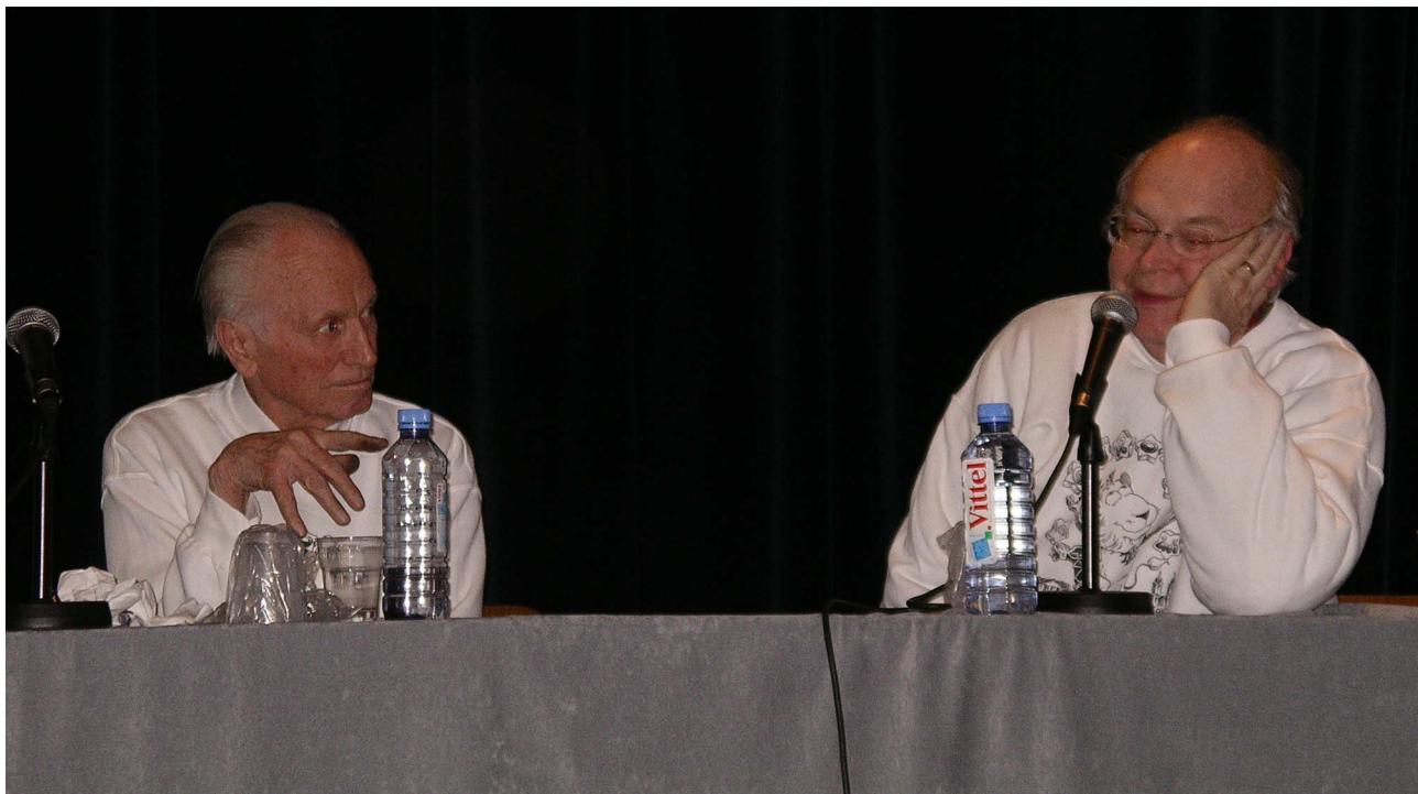
Panel discussion with Hermann Zapf and Donald Knuth: 'With a little help from the wizards' Hermann Zapf, Donald Knuth